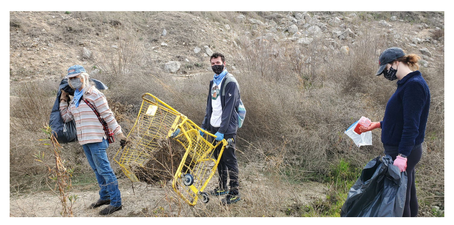
DAMAGED SHOPPING CART REMOVED