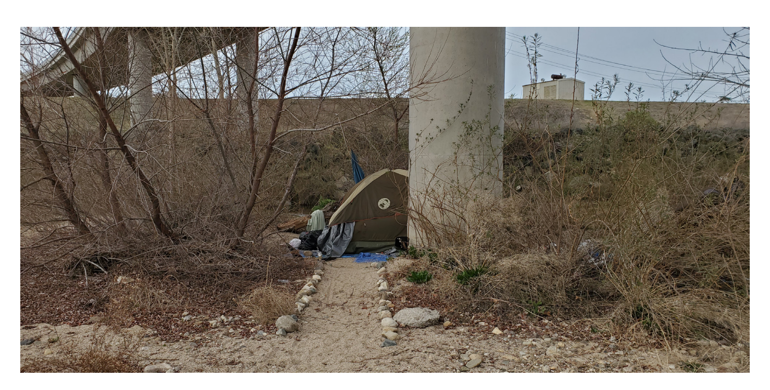
HOMELESS CAMP AT RISK IF THE RIVER RISES

A neatly kept campsite likely to be threatened by the river should it rise.