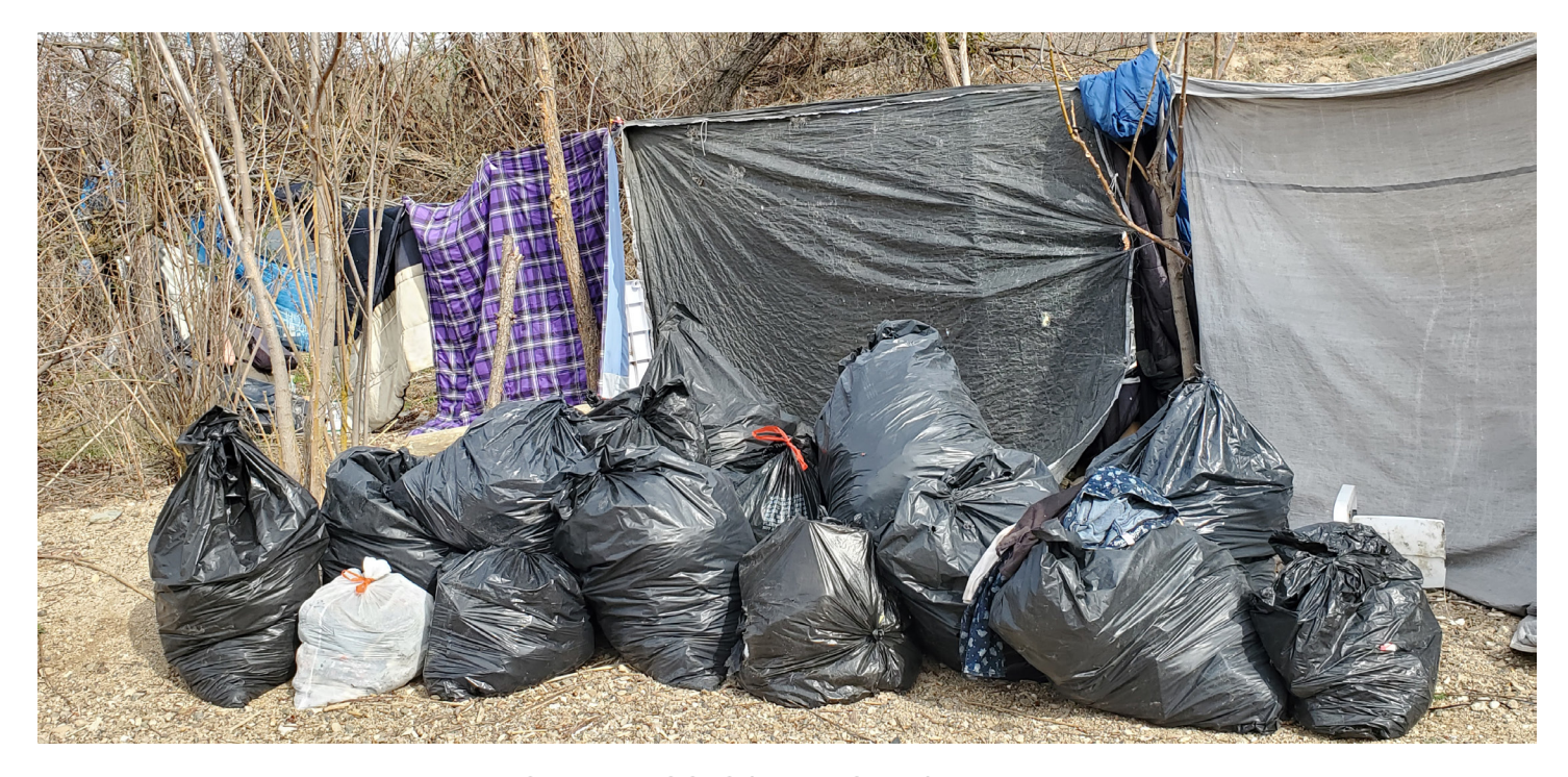
HOMELESS CAMP CLEANED UP

Unhoused people living in tents and camps in the Salinas riverbed may help with the cleanup or set their bags out for the Beaver Brigade to pick up.